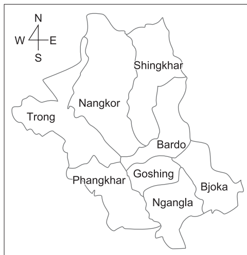
Fig. 2. Sketch Map of Zhemgang Districts Showing 8 Gewogs [ZDA 2007]